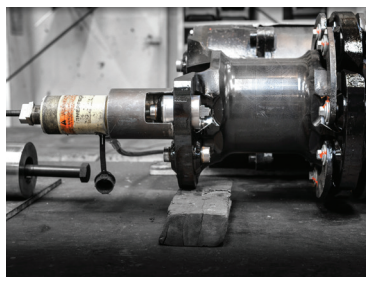
Replacing of spherical bearings