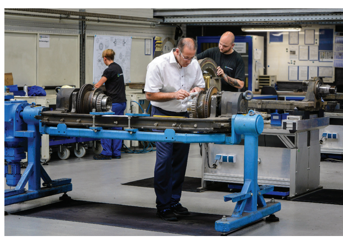
Refurbishment of EEF-Units