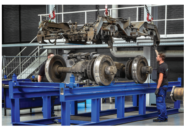
Handling of bogies