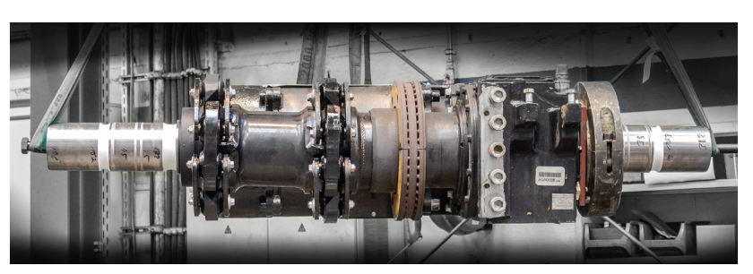
Mounting of gearboxes